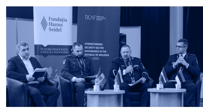
Panellists at the conference for National Police Day, 18 December 2023, Chisinau.