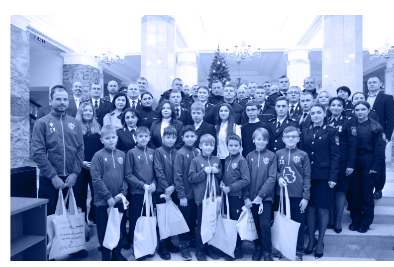
Anti-Corruption Day, 9 December 2023, Chisinau.

In recognition of International Anti-corruption Day, taking place on 9 December, DCAF supported the Internal Protection and Anti-Corruption Service (SPIA) of the MIA to raise public awareness of their function and activities. The SPIA visited schools to spark discussions about corruption and integrity, to distribute promotional material about their mandate, and organised a friendly football competition entitled "MAI for integrity - Integrity Cup". This support, coupled with other activities implemented under Outcome 2, aims at comprehensive integrity building in the MIA by complementing internal capacity building with external awareness raising and efforts towards reinforcing integrity as a cultural value.