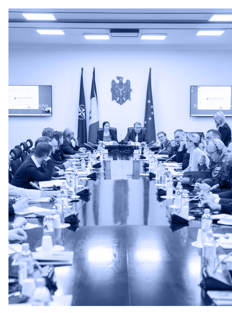
Workshop on disaster risk management, civil preparedness, and resilience building, 11-12 December 2023, Chisinau.

Between July and December 2023, the activities implemented by DCAF further laid down the foundations of the project, strengthened the relationship with the beneficiary and other implementing partners, and contributed towards the project's goals.