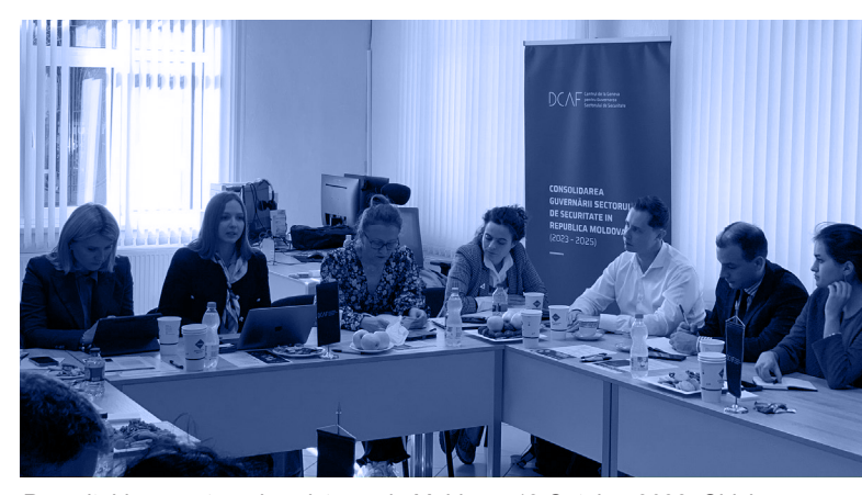
Roundtable on external assistance in Moldova, 12 October 2023, Chisinau.

Romanian Embassy in the Republic of Moldova). The event gave the opportunity to the participants to review the first draft of the study, and to validate the information and complement it as necessary.