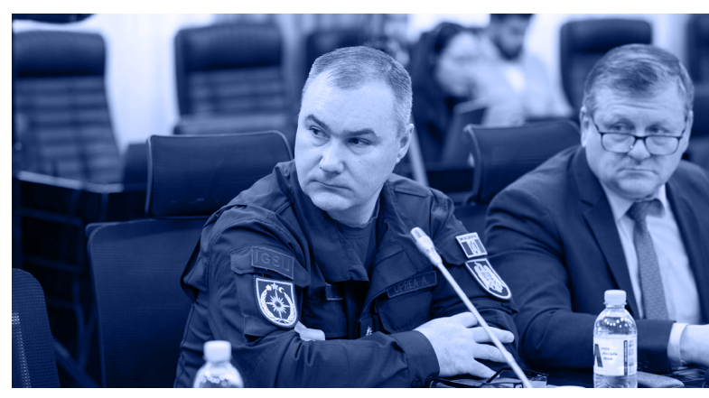
Workshop on disaster risk management, civil preparedness, and resilience building, 11-12 December 2023, Chisinau.

emergency situations, refreshed their knowledge of foundational concepts of disaster risk management and early warning systems, civil preparedness and how to build resilience, and throughout all this, the importance of upholding principles of good security sector governance.