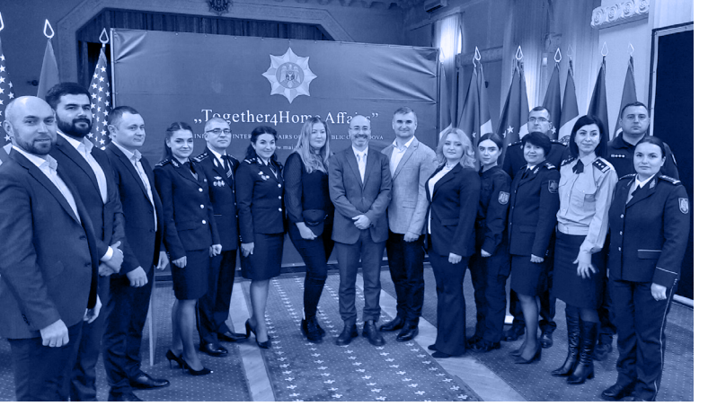
Facilitators, DCAF Staff, and MIA representatives during the Certification Cemerony, 7 December 2023, Chisinau.

As part of specific targeted trainings to increase strategic management capacities in the MIA, DCAF delivered a Workshop on risk management on 6 December 2023 for 26 representatives of strategic planning units from the MIA subdivisions.